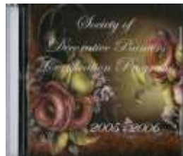
2005-2006 Certification CD Rom